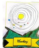
Hawking – David Carr