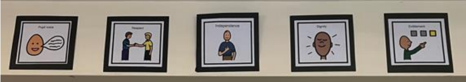
P – Pupil voice. R – Respect. I – Independence. D – Dignity. E – Entitlement

Above are our school values in visual form and we are proudly displaying these across the school. Our values underpin everything we do. We want all pupils, staff, families and visitors to follow our values so that Kelford School can be the best it can be!